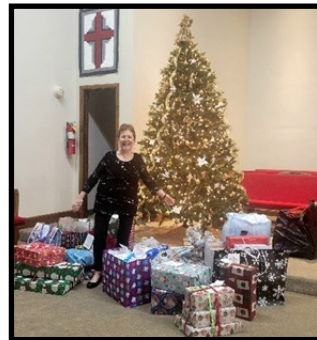
"Santa's Little Helper"

A special thanks to everyone who provided gifts for our church's Angel Tree. We helped bring a smile to the faces of 15 children of our community whose families have been struggling financially. We are all God's hand here on earth and do make a positive difference in the lives we touch.